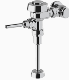
Variation Not Shown: 1.25" Flush Connection